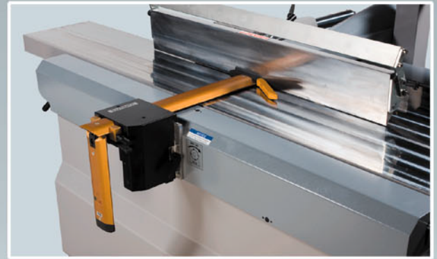
Two-Side folding spindle safety guard (OPT)

The Planner fence may be tilted to any degree between 90° and 45°. They are positive stops at 90° and 45°. It's easy and convenience adjustment without any tools.